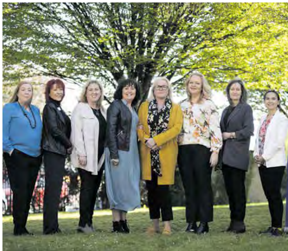
Members of the Pieta Ballyfermot Centre team pictured at Pieta's Ballyfermot Centre coffee morning, to highlight the centre's presence in the local community. Pieta has been providing free, professional therapeutic mental health services in the area since 2011.