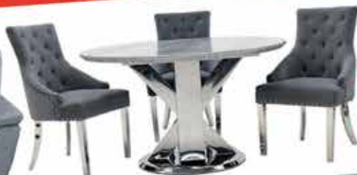
Table & 4 Chairs from €599