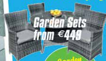
Garden Sets from €449

Garden Furniture Lines Now Added To Sale!