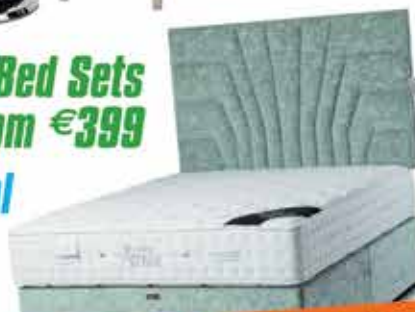
Occasional Furniture To Clear