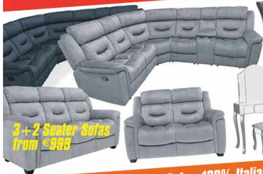
3+2 Seater Sofas from €999