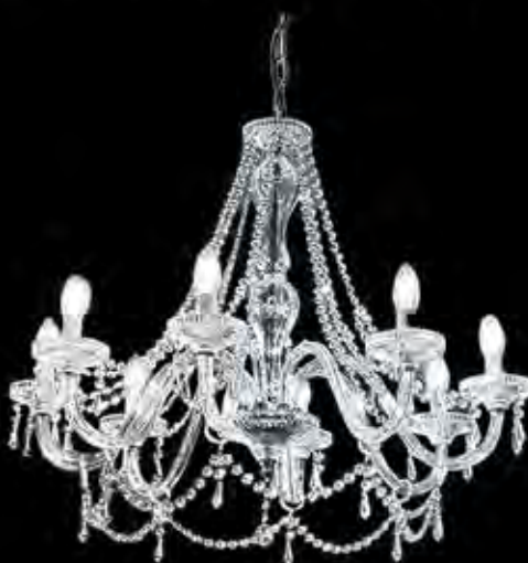
NAOMI 8 ARM RRP €1,995 NOW €745