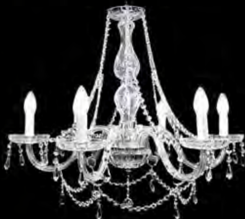
CLARISSA 6 ARM RRP €1,700 NOW €650

WAREHOUSE SALE 2023 AVAILABLE ON WWW.TIPPERARYCRYSTAL.COM