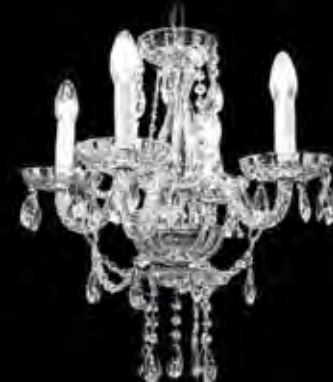
SHANNON ARM RRP €1,150 NOW €395