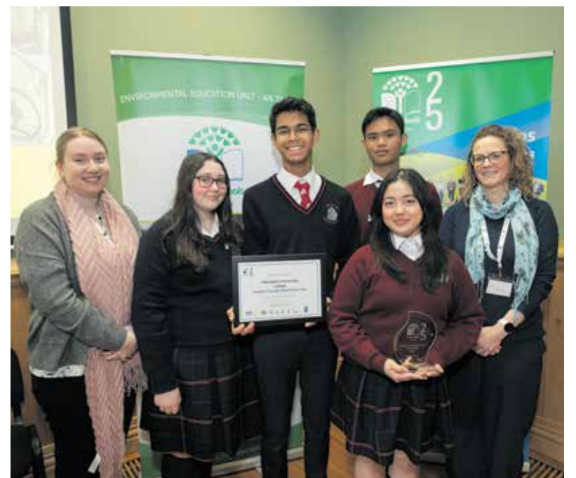
Lucan school Adamstown Community College was named one of Ireland’s Travel Schools of the Year (Cycling Mode) at a ceremony recently.