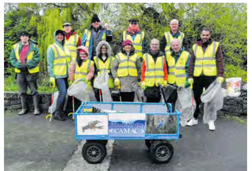
Clondalkin Friends of the Camac Group participated in the Dublin Community Earth Day Clean Up on Saturday 22nd April by holding an Earth Day Camac River Cleanup in Clondalkin Park all along the banks of the river. Pictured are volunteers who participated on the day.