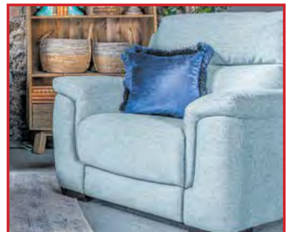
Donatello Powered Recliner Chair WAS €1395 NOW €695

Bray Retail Park, Southern Cross Road, Bray, Co. Wicklow