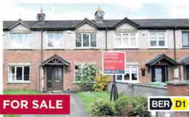
FOR SALE BER D1 14 Castlegrange Court, Clondalkin, Dublin 22 3 Bed Terrace. €275,000