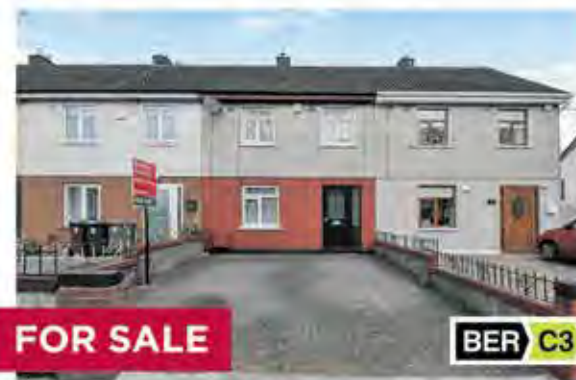
FOR SALE BER C3 5 Deansrath Road, Clondalkin, Dublin 22 3 Bed Mid Terrace. €230,000