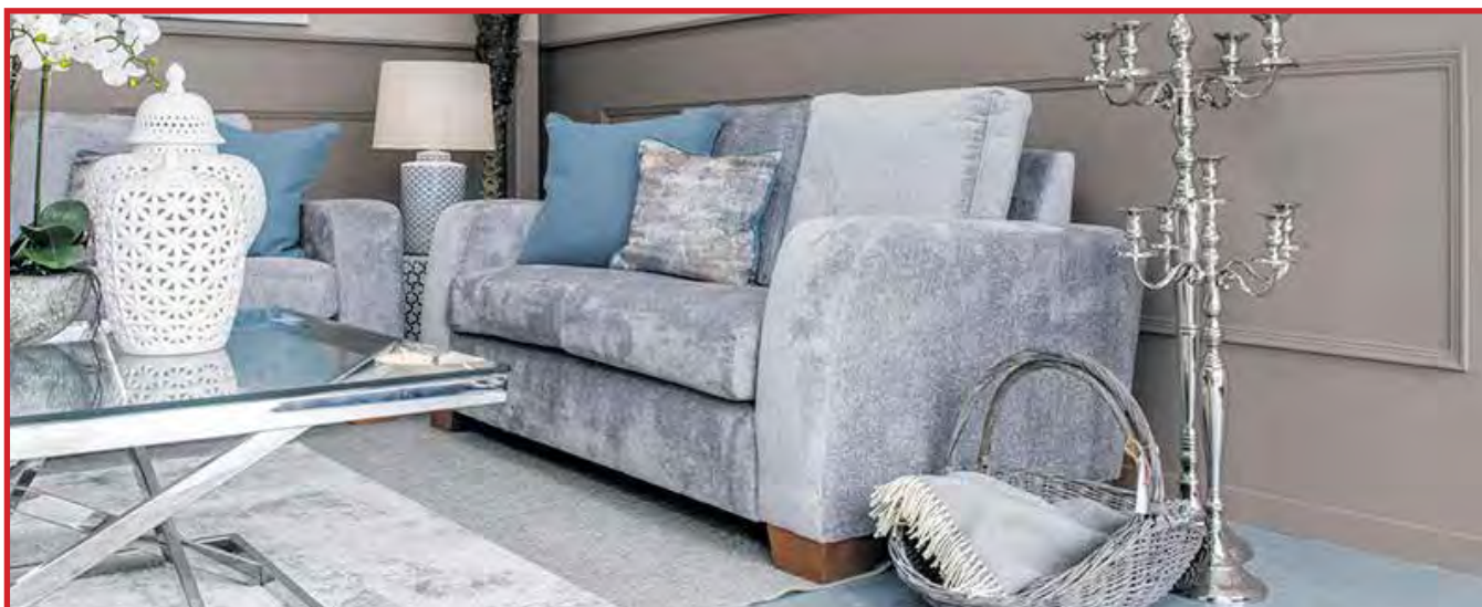
Orla 2 Seater & Armchair WAS €3890 NOW €1675