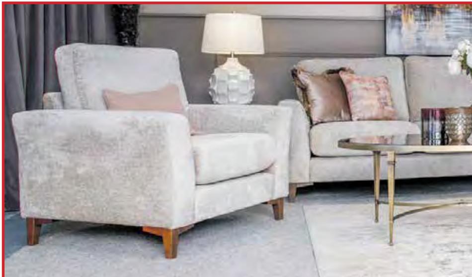
Arlo 2 Seater & 2 Armchairs WAS €4295 NOW €1895

UP TO €100 FOR A FULL SUITE PLUS FREE DISPOSAL OF YOUR OLD SUITE