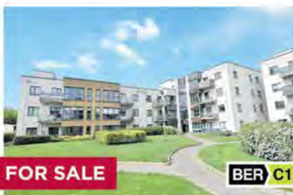
FOR SALE BER C1 Apt. 2, Belfry Hall, Citywest, Dublin 24 2 Bed Ground Floor. €225,000