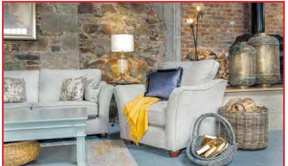
Cassandra 3 Seater WAS €2545 NOW €1745