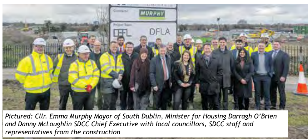
Pictured: Cllr. Emma Murphy Mayor of South Dublin, Minister for Housing Darragh O'Brien and Danny McLoughlin SDCC Chief Executive with local councillors, SDCC staff and representatives from the construction

Minister O'Brien said "It's fantastic to be here today to mark the commencement of works at the Clonburris Strategic Development Zone (SDZ). I am particularly delighted that South Dublin County Council will commence construction of their first tranche of social and affordable homes in the coming months. Increasing housing supply is at the heart of the Government's Housing for All plan. Clonburris is a prime example of a sustainable neighbourhood, and the state is investing substantial funds to ensure that the necessary infrastructure is in place, this includes parks, community buildings and active travel works. In the future there will be some 23,000 people