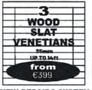
NEW REPAIRS SYSTEM ON ALL WOOD BLINDS